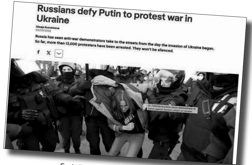
Faximile from DW 3 September 2022

really was the case: a country like Russia is armed to the teeth, surrounded by neighbouring countries without any military. How long do you think the population in Russia will accept a leader that spends billions arming against countries that cannot possibly be considered a threat? Even if Russia continued to be heavily armed and saw this as an opportunity to invade all its neighbours, how many resources do you think it would take to uphold an occupation of all of Europe against determined, well prepared and completely unruly populations?