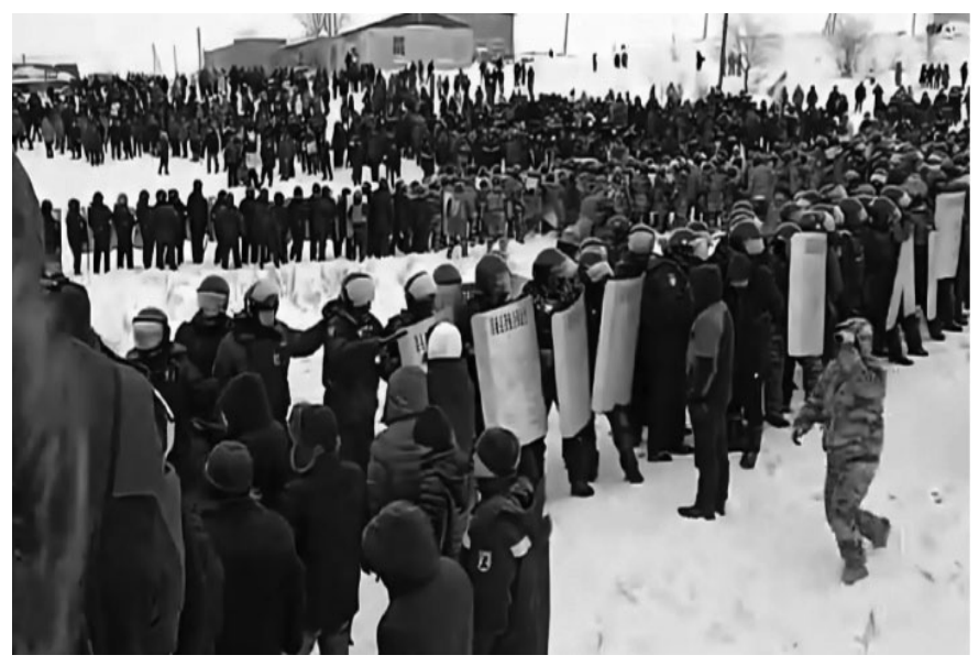
Protesters and police in Baymak, Russia. January 2024.