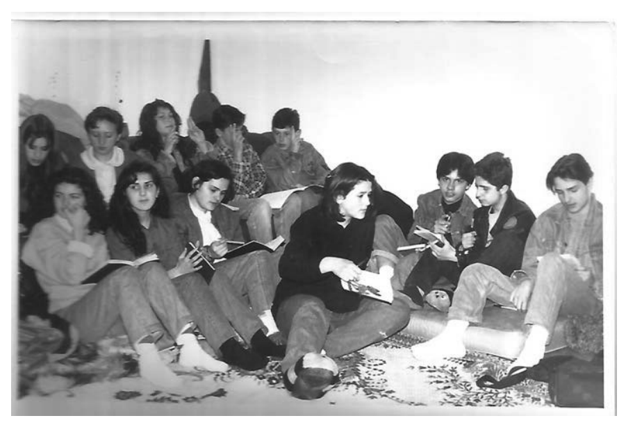
Xhevdet Doda students attended class in home-schools for a few months before teachers and students 'occupied' the decrepit building in central Prishtina. 1990 or -91.

Russia is dictatorial, it still wants to uphold the image that it is a democracy. A relatively safe form of non-cooperation is to boycott events, to simply stay away and refuse to participate.