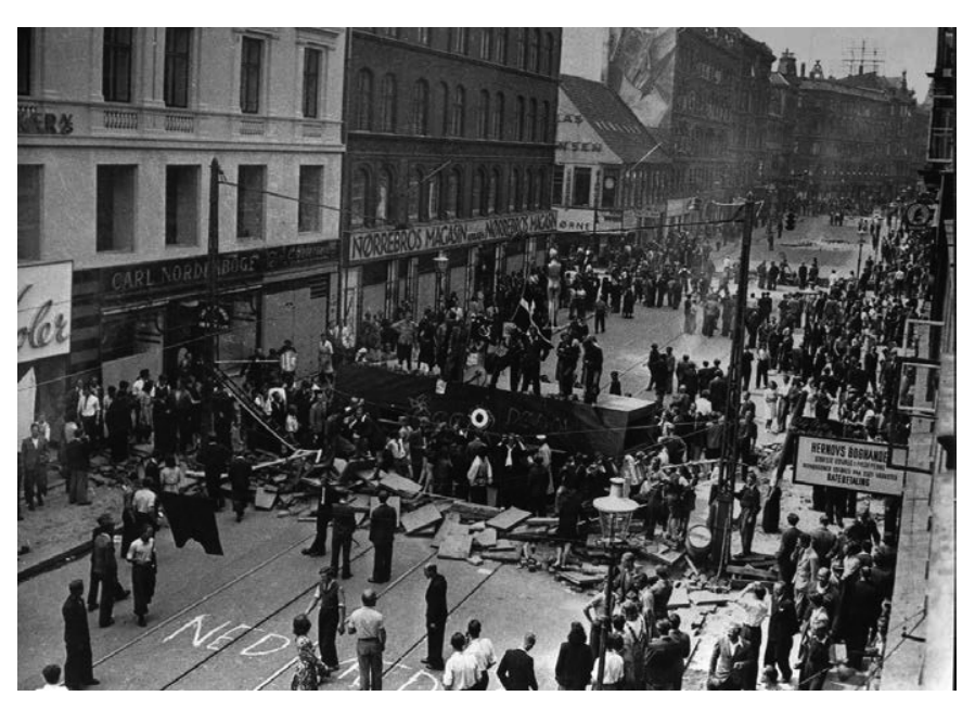
The people's strike in Copenhagen 1942.

Sabotage and riots might also play a role when it prevents the occupier from having the calm that they long for. It means that more personnel and other resources are tied up in maintaining the occupation, and cannot be used to fight a war on the frontline. I think we need to discuss such aspects much more among scholars of nonviolence. This requires an openminded evaluation of the role of sabotage and riots, considering both how they might support nonviolent actions, as well as what the price of sabotage and riots might be. Maybe the less risky adoption of nonviolent methods without sabotage and riots can be sufficient to disturb the calm and keep the fighting spirit high. I have already mentioned some options in relation to Ukraine, and this is something that could be studied more in historic cases.