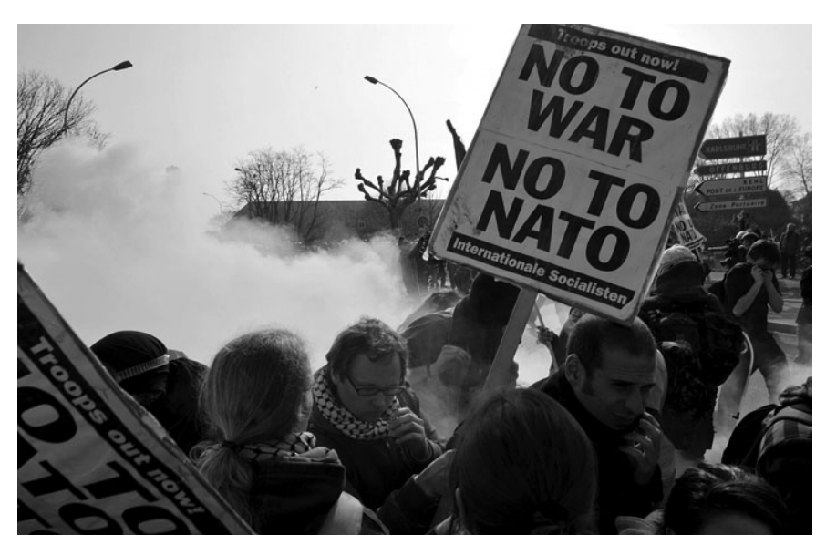
NATO protest Strasbourg.

The Sceptic : But Russia's attack on Ukraine proves exactly the opposite, that NATO is needed more than ever, to defend western countries from Russia!