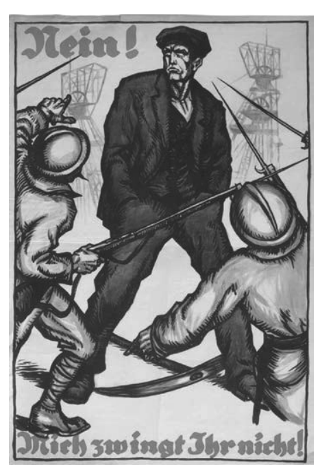
"No! You don't force me!" Protest poster from Ruhr 1923.