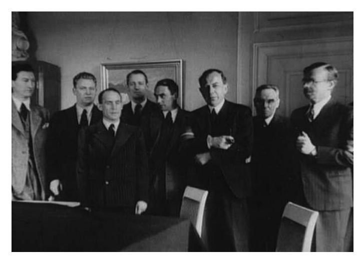
Members of the Danish Freedom Council after the Occupation.

In Denmark during WWII, the Freedom Council, which was coordinating the resistance movement, wrote in an internal report that strikes were causing more damage to the German war effort than riots and sabotage. This insight was written after an event in 1944 known as "the people's strike", when the resistance movement had been conducting sabotage for years. <sup>20</sup> However, this knowledge is almost unknown in Denmark, where the dominant narrative about the heroic sabotage still prevails. <sup>21</sup>