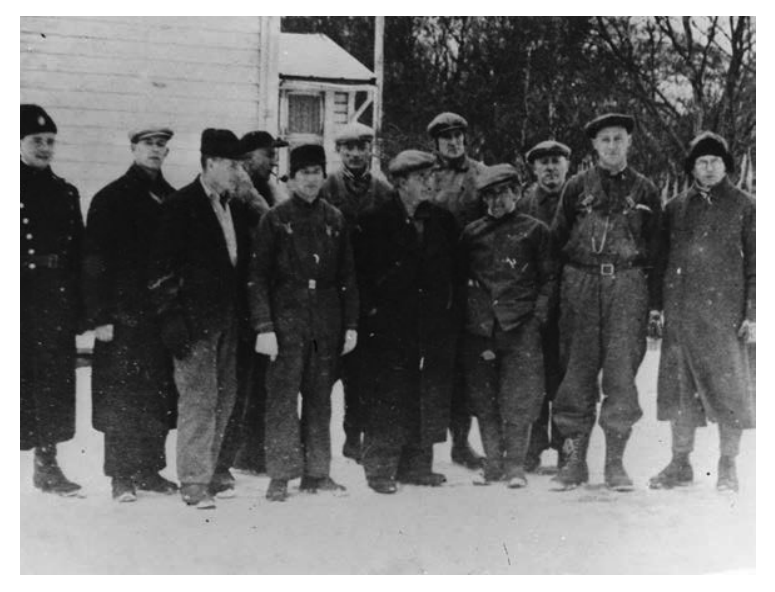
Teachers in prison camp in Kirkenes, Norway 1942.

German occupation administration interfered. They instructed the police to arrest 1100 male teachers, which was done across the country. Here one can speculate about why most of the Norwegian police were so obedient, and what would have happened if they had also refused to cooperate with the Nazis and neglected to arrest the teachers? But that would have been a different story. 1100 teachers did get arrested and eventually about half of them were sent to hard labour in the north of Norway. Along the way they were exposed to torture, and given inadequate food and shelter. Some